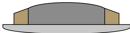
Slightly Domed Across Top Full Comfort Fit