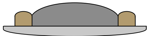
Domed Across Top Full Comfort Fit